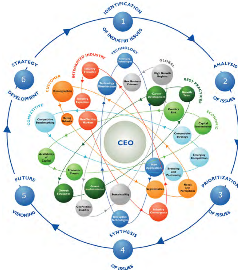
Chart 2: CEO's 360-Degree Perspective™ Model

how our researchers and consultants embed the CEO 360-Degree Perspective™ into their analyses and recommendations.